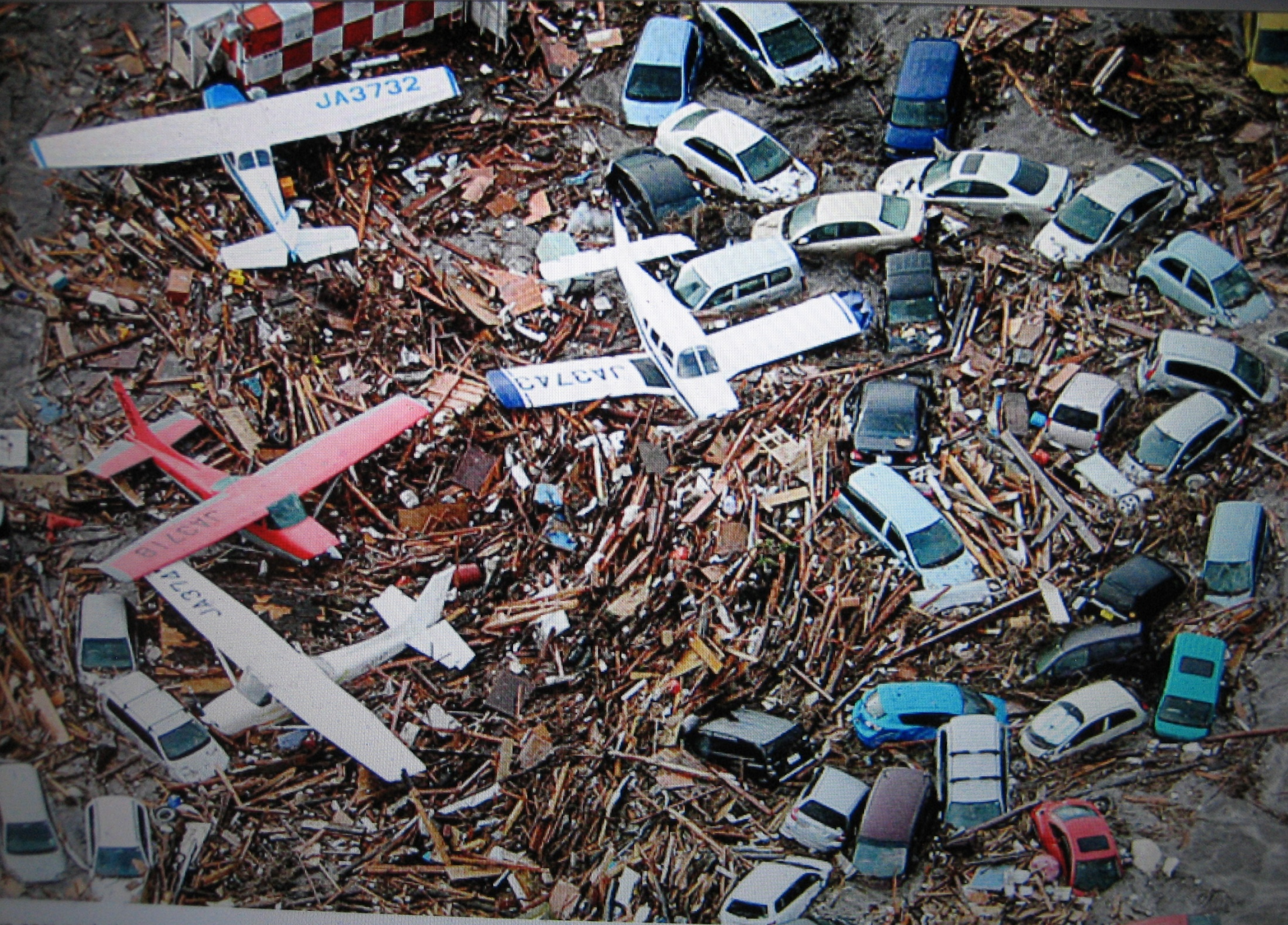
cars and planes tossed about like toys at Sendai Airport in northeastern Japan.