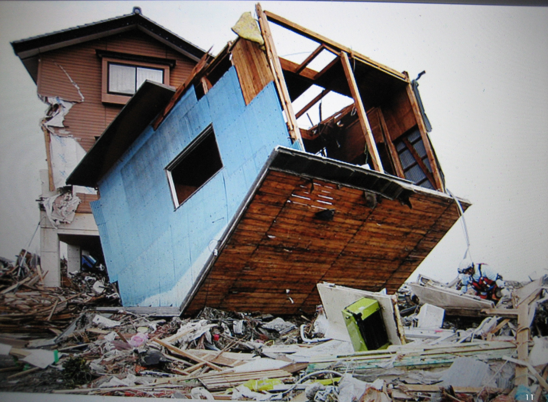
Rescue workers search for bodies under an upturned house.