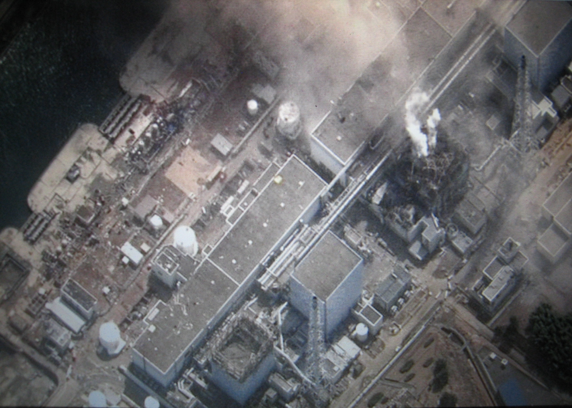
the Japanese authorities are seeking to allay fears following a third explosion and a fire at the Fukushima nuclear plant which